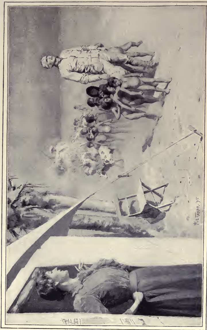
“Walking slowly at the head of his flocks.”